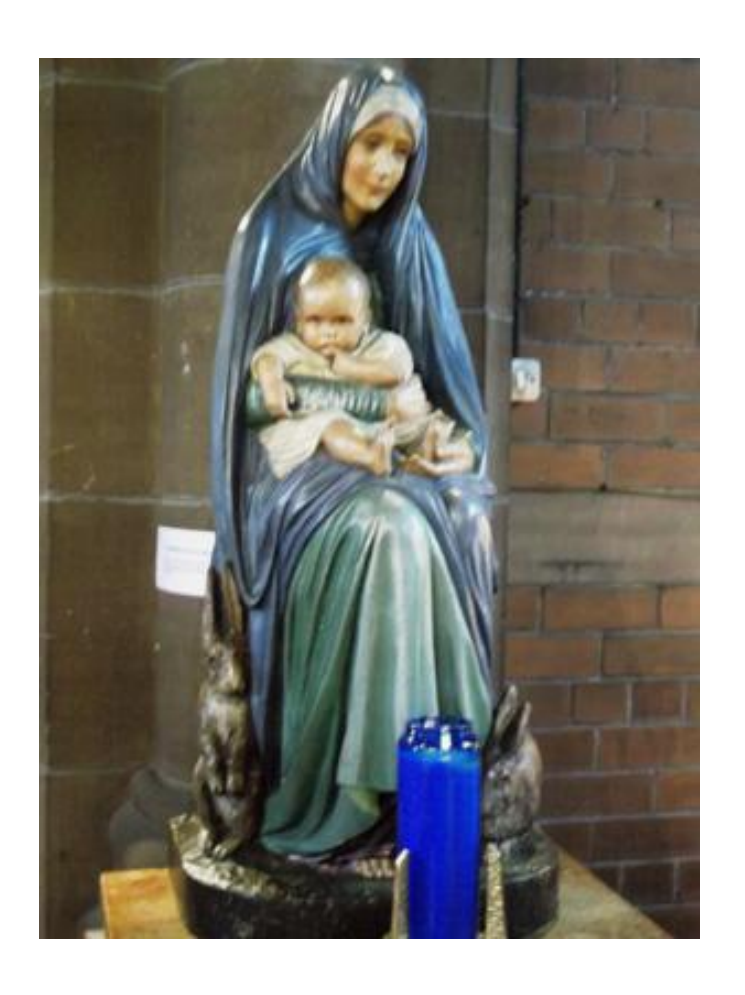
What one thing will you remember about all this in seven days' time? The way the sunlight lit up all the smoke.

Coming soon: background, explanation and comment